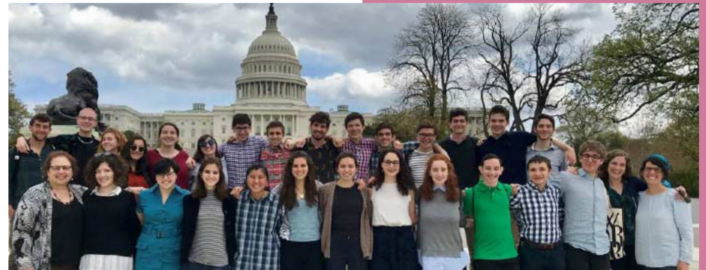
Exploring Jewish life in America, on the steps of the Capitol.