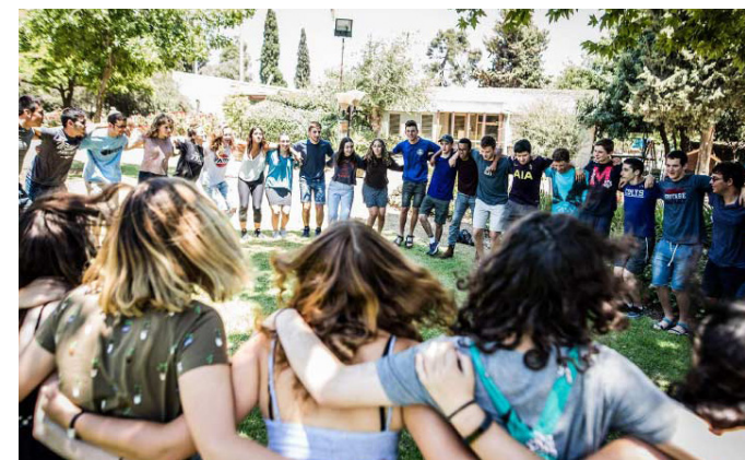
Israeli and North American Fellows do a joyous circle dance together.