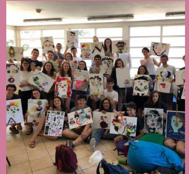
Fellows pose with their wonderfully diverse self-portraits after a workshop with an Israeli artist.